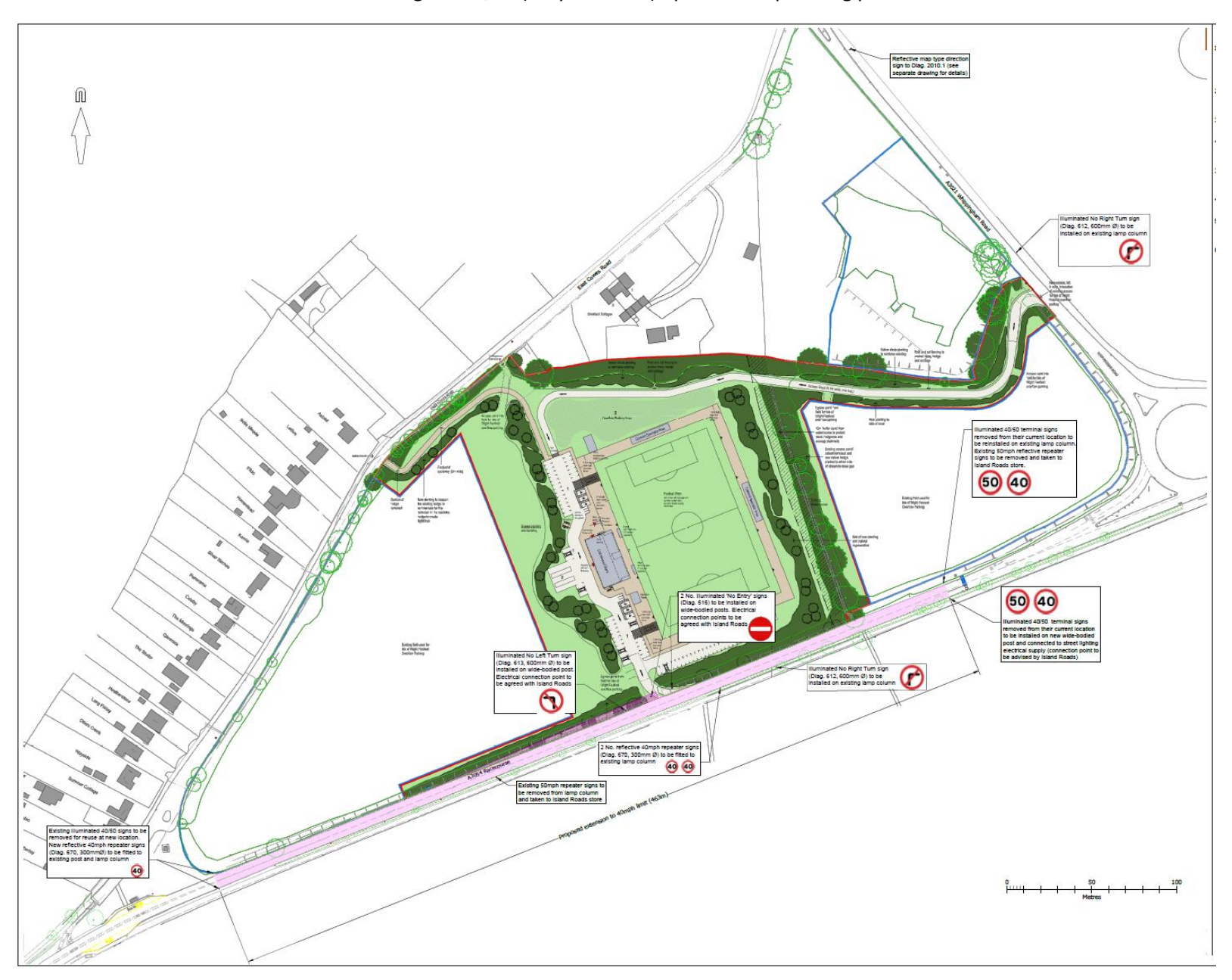
Page 1 of 2